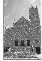
St. Mary Church Est. 1919